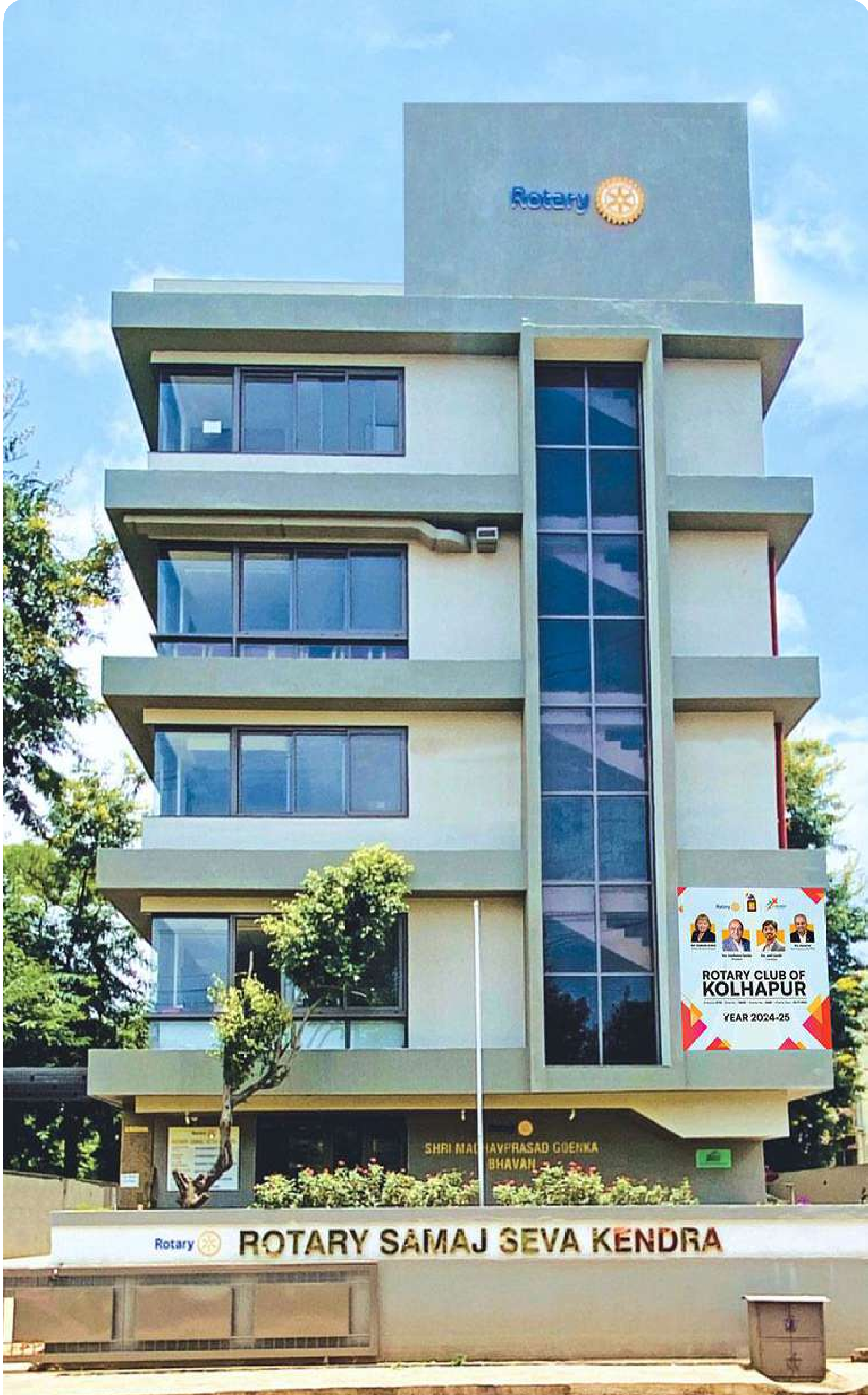
ROTARY CLUB OF KOLHAPUR'S ROTARY SAMAJ SEVA KENDRA BUILDING