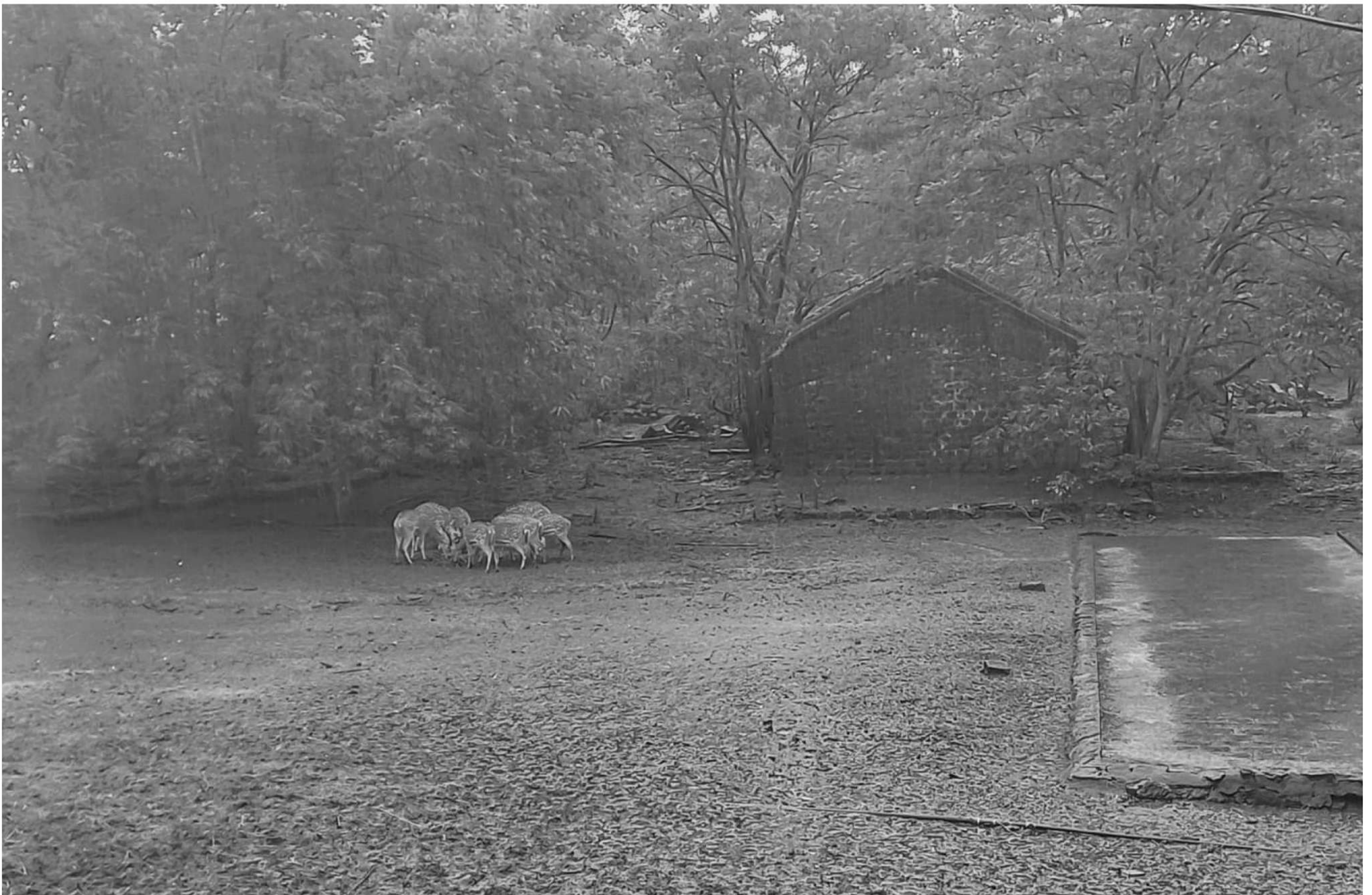
DEERS IN RAINS.FACING EACH OTHER AND TRYING TO PROTECT.